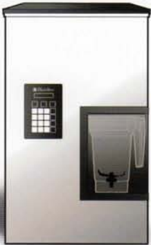
BDI\BI (Wide) 19" w x 14.5" d x 32" h