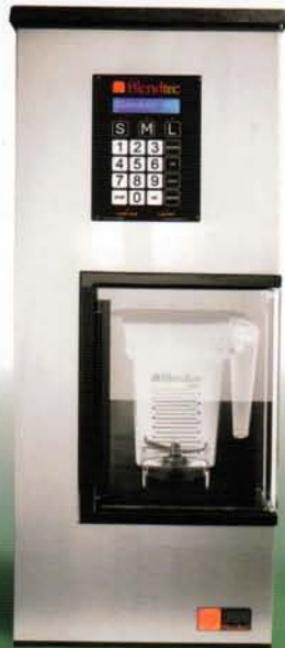
BDI, BI NARROW MODEL