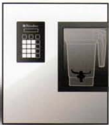
BD8 19" w x 14.5" d x 21" h