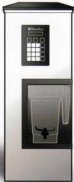
BDI\BI (Narrow) 12" w x 21" d x 32" h