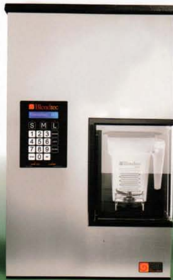
BDI, BI WIDE MODEL