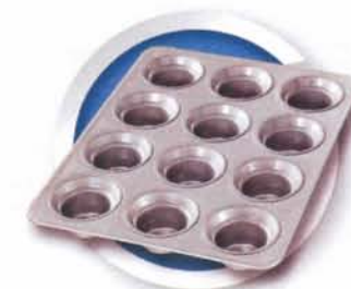
Mini Crown Muffin Pans