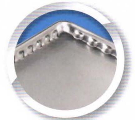
Continuously Reinforced Sidewalls

Bundy Baking Solutions: American Pan / Chicago Metallic / DuraShield / Pan Glo / RTB / Shaffer