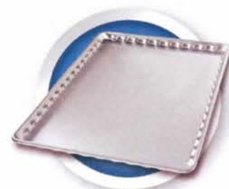
StayFlat™ Sheet Pan