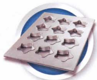
Star Cake/ Muffin Pan